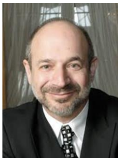
Bruce A. Beutler, M.D.