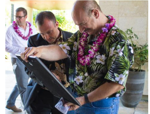
Dr. Bruce Beutler (right), 2013 Nobel Prize winner in Medicine, with Hawaii Senator Josh Green at the UH Cancer Center.

Assistant Professor Microbiology and Immunology Department University of California San Francisco San Francisco, CA USA