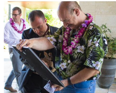
Dr. Bruce Beutler (right), 2013 Nobel Prize winner in Medicine, with Hawaii Senator Josh Green at the UH Cancer Center.

Assistant Professor Microbiology and Immunology Department University of California San Francisco San Francisco, CA USA